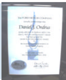
THE HENRY FORD TECHNOLOGY AWARD